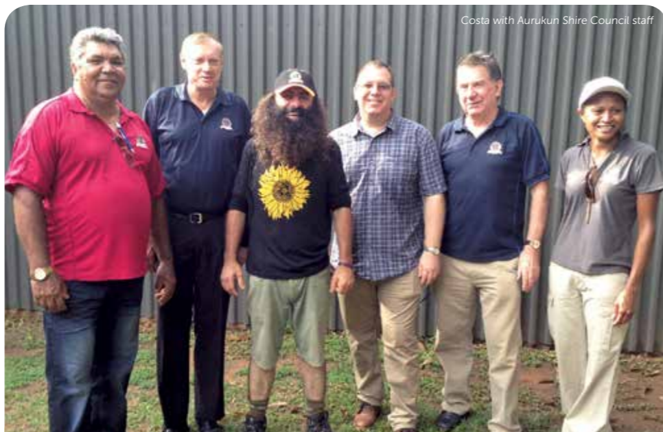
Costa with Aurukun Shire Council staff

"We look forward to continuing to seek funding to better improve road infrastructure in our community."