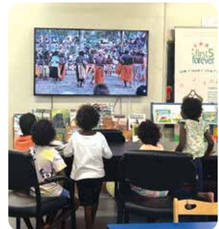
Kids in the front line watching Aurukun dancers’ videos from the Lockhart Dance Festival

The IKC continues to be a safe, calm environment where people gather to enjoy a cup of tea, share yarns, watch documentaries, play with computers and explore books.