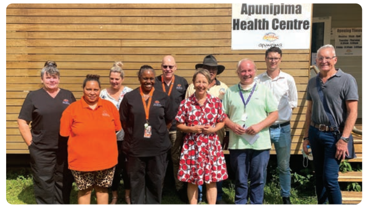
The team from Apunipima took time out from their busy schedules to meet with the Champions and discuss health issues in the community.