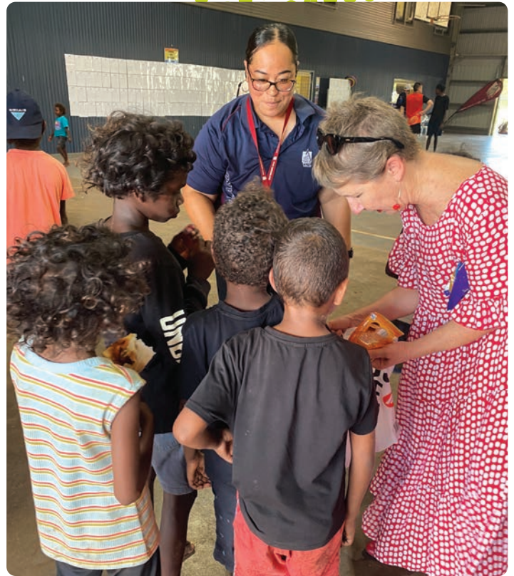
Minister Di Farmer handed out Easter eggs to the younger children at the Aurukun PCYC while observing the school holiday activities.