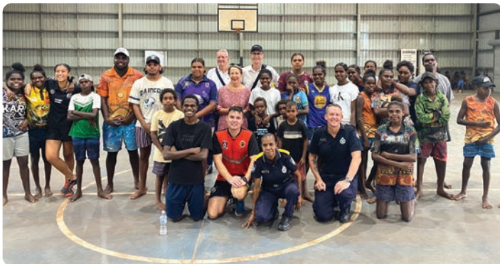
Ball games paused for the Champions to have a group photo with the AFL Cape York representatives working with the PCYC team to deliver school holiday activities in Aurukun.